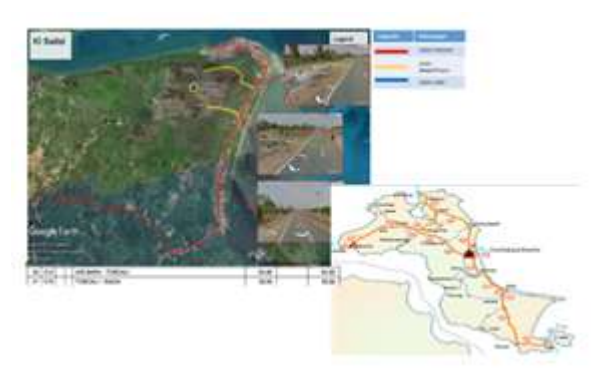
Figure 3 Sadai Industrial Area Road Network

Based on the 2020-2024 National Medium Term Development Plan, one of the strategic areas and major project developments for the Bangka Belitung Islands Province is the development of the Sadai industrial area located in the South Bangka Regency, Bangka Belitung Province.